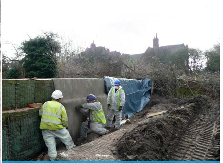
Fixing CC to gabion structures using re-bar staples