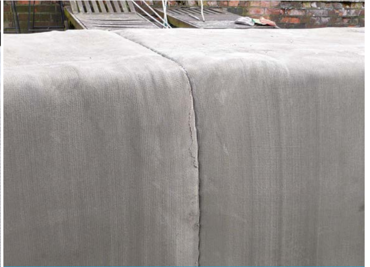
Flush seamed joints between hog ringed CC layers