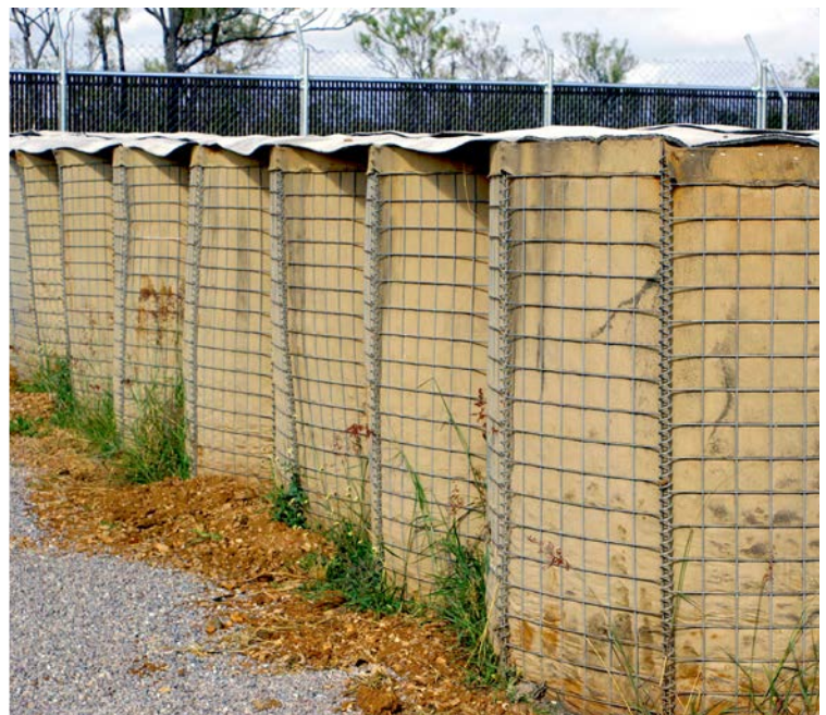
CC cap provides protection from inclement weather and high winds

The Australian Army were very pleased with the end results, and were impressed at how quickly and easily CC was installed using only a small installation team, basic hand tools and water.