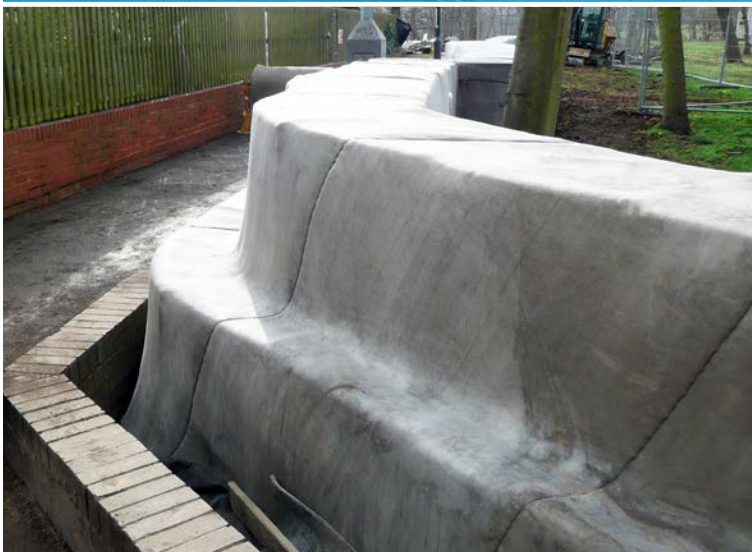
Hydrated CC prior to backfilling toe anchor trench