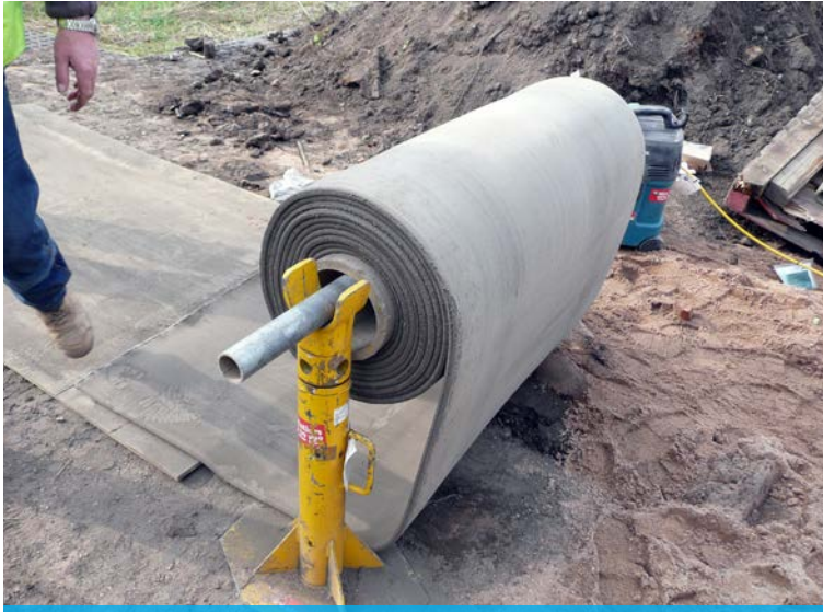
Dispensing 20m pre-cut rolls of CC13™ on site before cutting to length