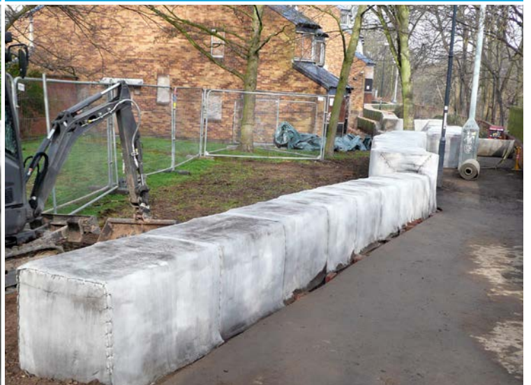
Completed CC lined gabion section