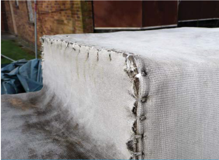
Hog ringed CC layers