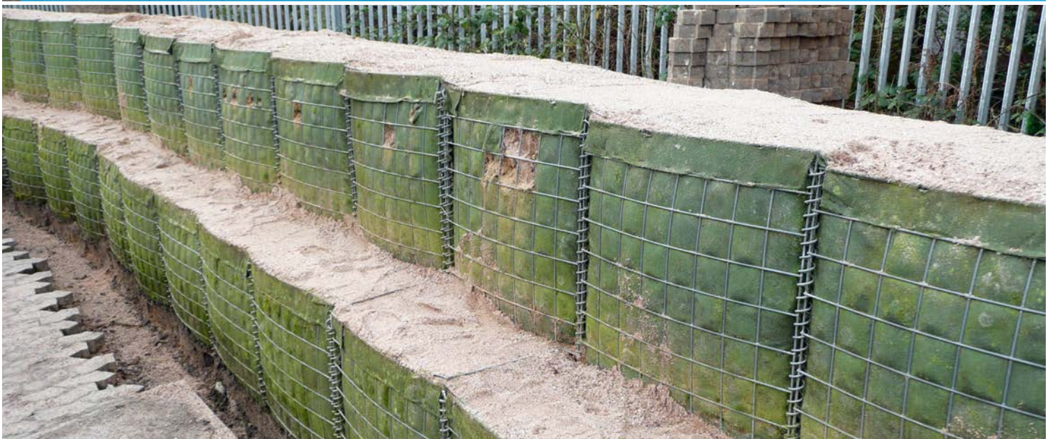
Degraded gabion flood defences, damaged from weathering and vandalism